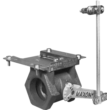
2" Series "CV" Valve with optional connecting base and linkage assembly

Versions available with UL (Underwriters Laboratories) listing for air, natural gas and liquefied petroleum gas service.