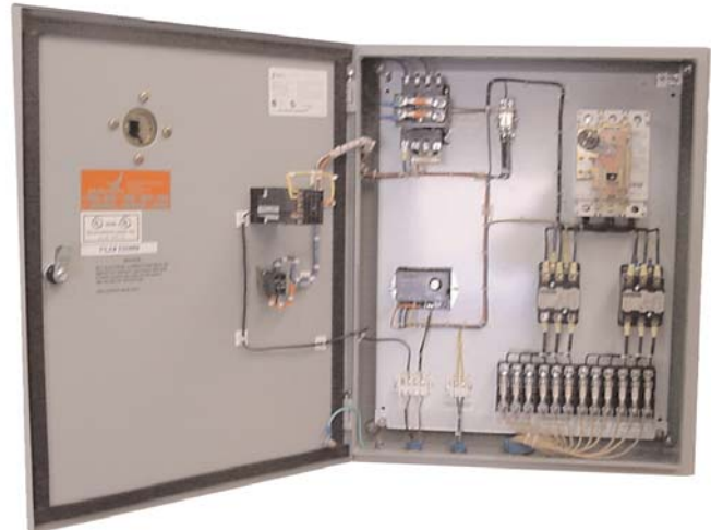
LHE UL Listed Control Panel

Each line heater unit is equipped with a digital electronic temperature controller. After the controller is set at the desired temperature, the line heater automatically controls the temperature of the oil, thus eliminating overheating or underheating. The oil temperature is measured by a thermocouple located inside the discharge end of the heater.