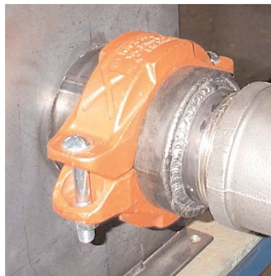
Grooved Couplings for Easy Removal and Cleaning of Heat Exchanger Tubes

The LHE's low watt density heat input permits the heating surface to operate at lower temperatures and thereby reduces coking and the frequency of cleaning and servicing. The heat exchanger tubes can be easily removed via the grooved coupling for cleaning of any coking buildup. If required, the heating elements can also be easily removed and replaced.