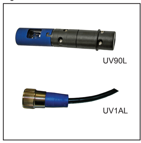
Fig 1. UV Scanners